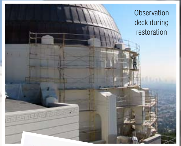
Observation deck during restoration