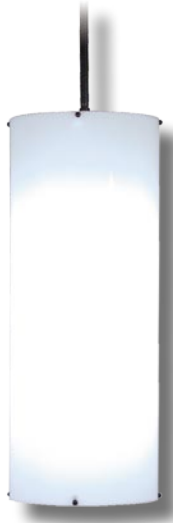
14" dia. W x 36"H (356 x 914mm)

CH170-LED illustrated with options: Downlight -DL Delete Wood Accents -DWA Stem Suspension -STM