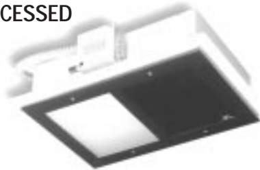
Shown with Distributing Lens -DL in one compartment