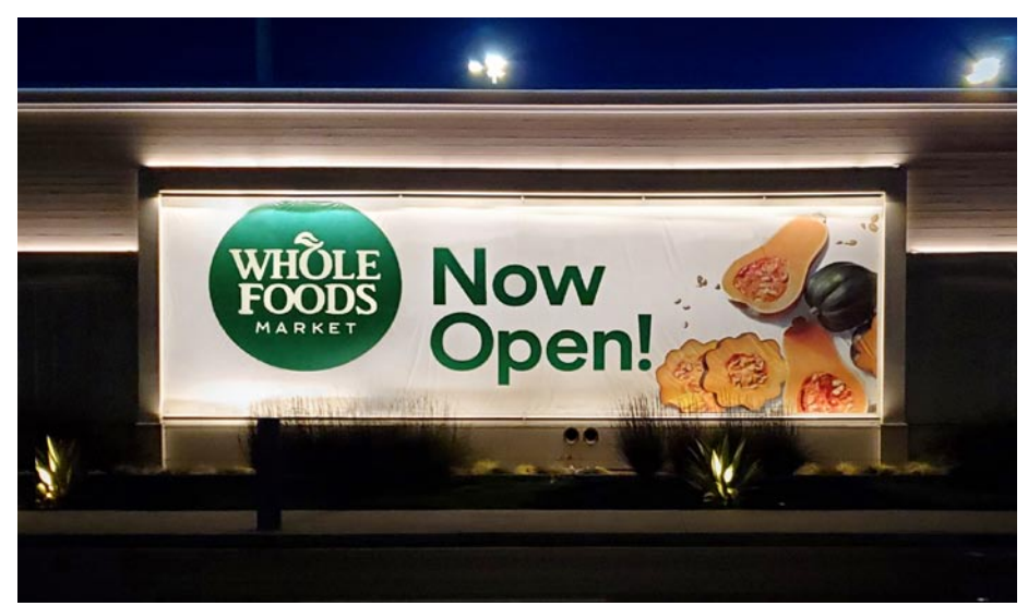
2nd & PCH - Long Beach, California. 51 foot lenghts top and bottom.